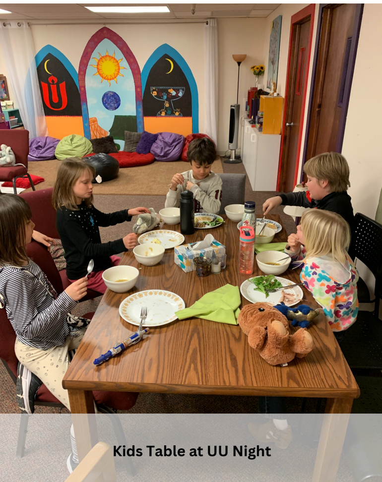
Kids Table at UU Night