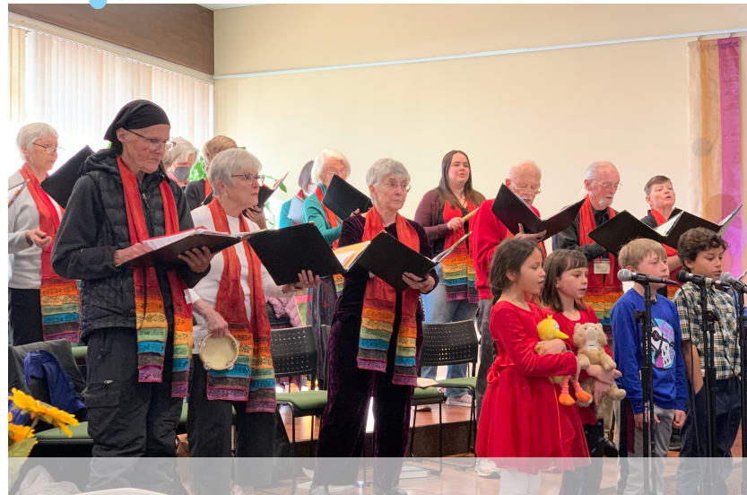
UUCGV Choir & Youth Music Sunday, December 17th - Joy Throughout the World