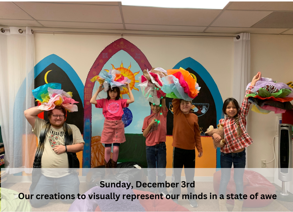
Sunday, December 3rd Our creations to visually represent our minds in a state of awe