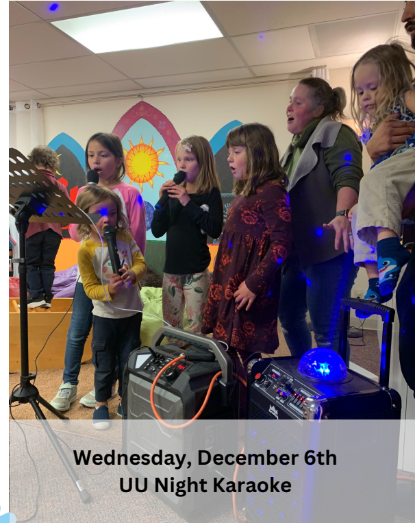
Wednesday, December 6th UU Night Karaoke